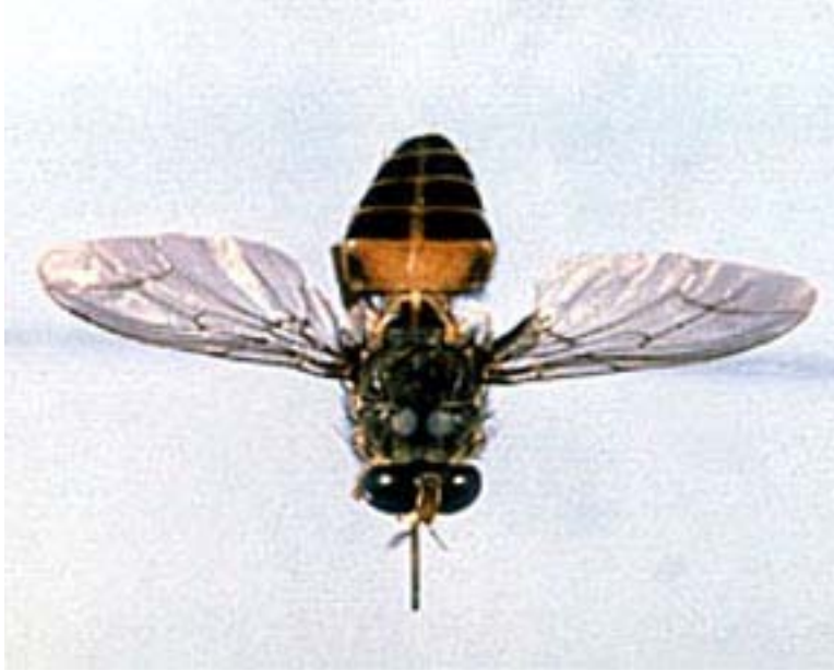
Fig. 2: The Tsetse fly, Glossina spp.