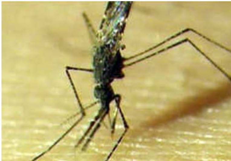
Fig.1: Anopheles mosquito, the malaria vector.

Ninety percent of the 1.5 to 3 million people who die from malaria per year are in sub-Saharan Africa, and it is still a problem that did not attract as much attention as the Human Immunodeficiency Virus/Acquired Immunodeficiency Syndrome (HIV/AIDS). People in poor, remote villages are usually unable to get treatment.