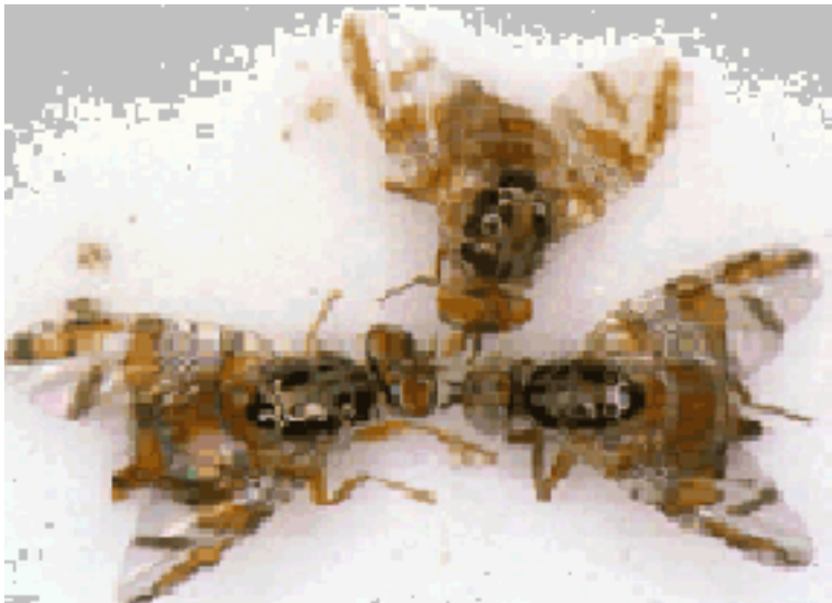
Fig. 3: Mediterranean Fruit Fly, Medfly, Ceratitidis capitata .